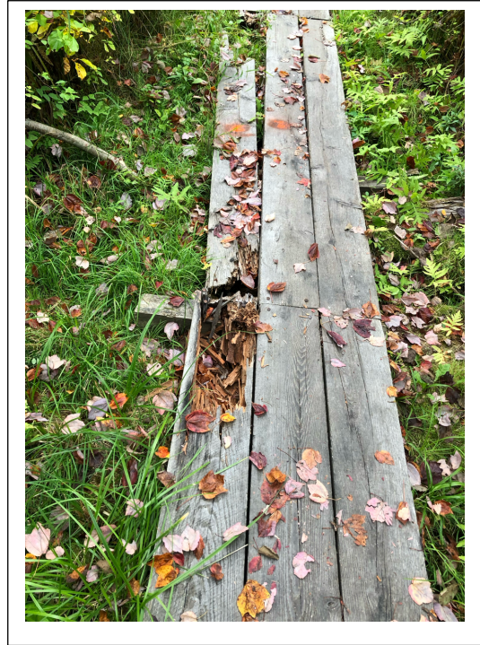
Boards on the Outer Loop Trail marked with orange paint and ready for replacement boards.